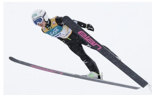
TAKANASHI competing at 2014 World Cup ski jump

Japan also has a great prospect for a medal in ski jump this time: Sara TAKANASHI. She is a rising star in women's ski jump, who has already won her eighth World Cup event of the season last month. TAKANASHI was actually born and grew up not too far from Asahikawa, in Kamikawa. The 17-year-old athlete might just bring a big surprise for Japan's Olympic team.