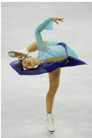
ARAKAWA at 2006 Olympics

Ninety-eight events in fifteen winter sports will be held overall. 136 athletes from Japan will be competing in all fifteen sports. Japan, along with South Korea and China, is one of the few nations in Asia that consistently rank in top 20 in Winter Olympic Games. At the 2010 Winter Olympics in Vancouver, for instance, Japan earned five medals, including three silver and two bronze. Japanese athletes showed exceptional strength in speed skating and figure skating. Also at the 2006 Winter Olympics in Turin, Italy, Japan finished with the 18th in overall rank, even though the country earned only one gold medal, won by Shizuka ARAKAWA in women's figure skating.