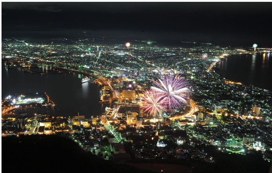
A view from Mount Hakodate at night