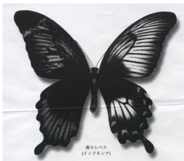
Ascalaphus Swallowtail ( Papilio ascalaphus ) South Sulawesi (Indonesia)