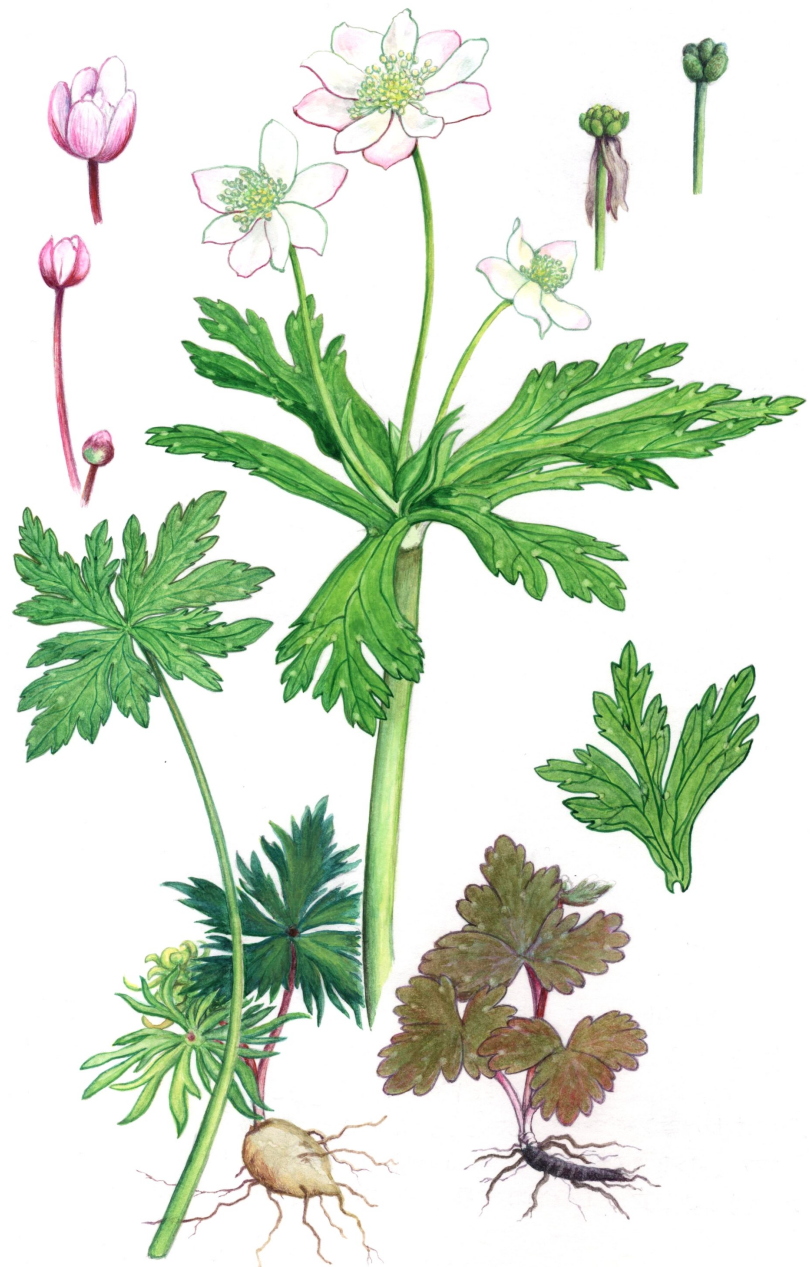
Water Colour Painting of a Nirinsô By Hitoshi KUDOH

Description: A rhizomatous perennial of late spring ephemeral. Has a 3-foliolated involucre on top of the stalk. 1~3 short peduncles appear from the involucre. Cups of pinkish to white flowers are borne on each top of the peduncles. They are sepals. The basal leaves are 3 lobed compound and have soft petioles. 15~25cm tall.