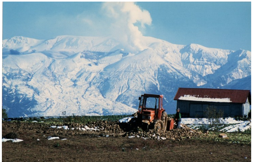
Sugar beet harvesting on the outskirts of Tokachidake Volcano.

For winter-sport lovers, this month is when they are trembling with joy, wishing for fine powder snow. Every year, top class athletes in Nordic-skiing are setting up their training camps in the Asahidake spa area. You'll see them running so fast that they seem to be flying, Of course, in Asahidake, you also can enjoy skiing earlier than any other place in Japan for the winter-sports season.