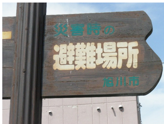
A sign showing a refuge spot; no English or any other words are added.

September 1 st is a national memorial day for Disaster Prevention. It might be very puzzling for you that a nation would designate a national memorial day on account of disaster prevention. September the 1 st is the date of the 1923 Kanto Great Earthquake. On this date Tokyo, Yokohama, and nearby districts suffered a magnitude 7.4 earthquake that resulted in 105 thousand lives lost and people displaced, as well as 370 thousand houses/buildings burned or destroyed. Unfortunately, at the same time a typhoon destroyed Tokyo turning it into an inferno that claimed the lives of 3,400 people.