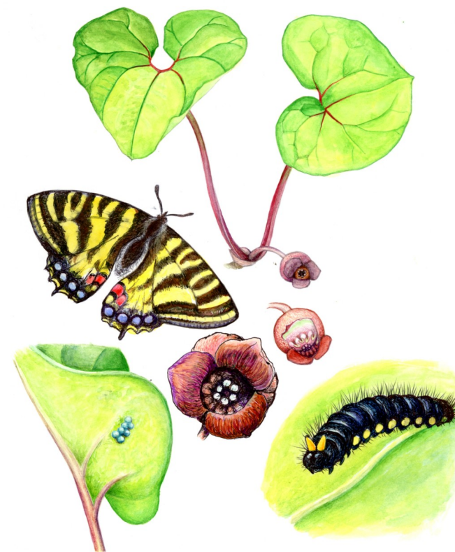
Watercolour painting of Okuezo-Saishin

Distribution: Hokkaido, Northern Honshu; Far Eastern Russia, China