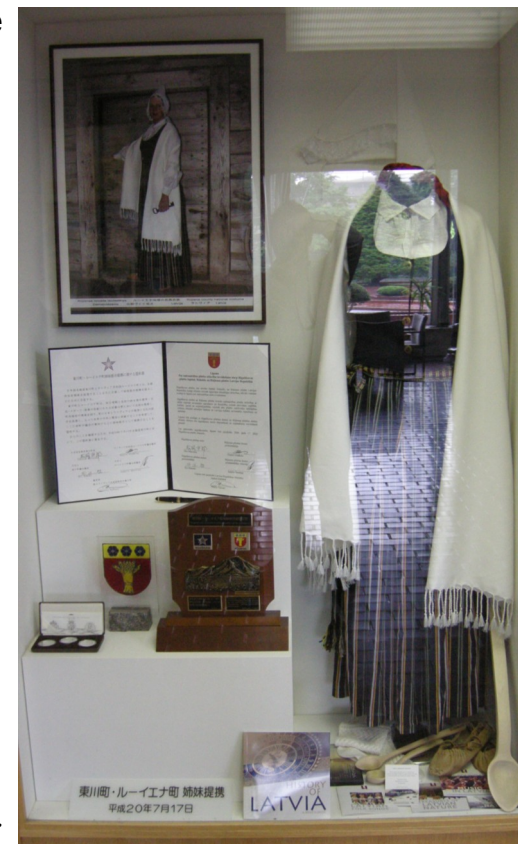
Latvian display in Higashikawa Town Hall