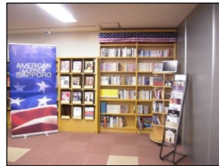
American Corner at the Sapporo International Plaza