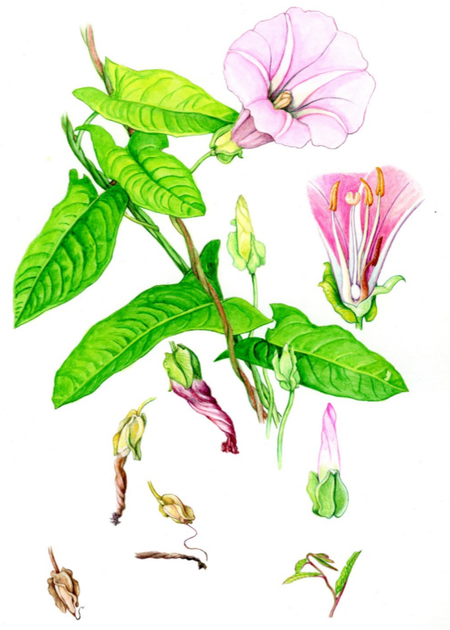
Water colour painting of a Hirugao By Hitoshi KUDOH

Distribution: Hokkaido, Honshu, Shikoku, Kyushu; Eastern China, Korea.