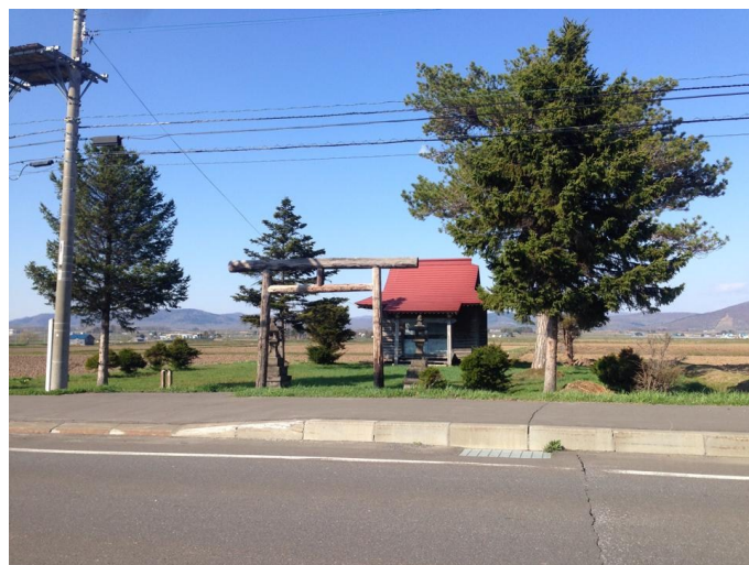
One of Lawson's favorite spots in Takasu Town

AIC: Japanese anime really deserves credit for attracting foreigners to Japanese culture and language. What was your first impression of Hokkaido?