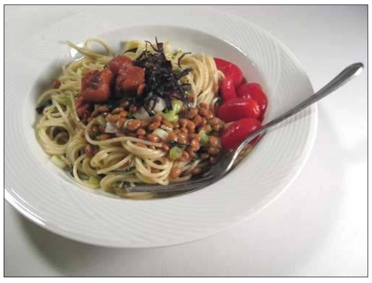
Natto Spaghetti (source: http://1tess.wordpress.com/2010/06/19)

Natto!! At first, I did not like it at all. I could not stand the slimy texture and stinky smell of it. But my husband made me natto spaghetti once, and believe it or not, I loved it. He mixed natto and umeboshi, stirred it for a while to tone down the smell and the texture, then put spaghetti and olive oil together. Gradually, I could eat just natto itself and now I like it very much. I always have natto in my fridge these days.