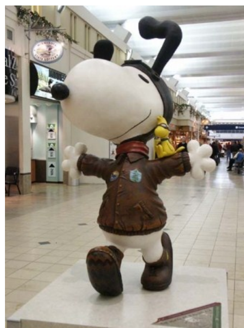
Snoopy “The Northstar Aviator” at Minneapolis-St. Paul International Airport