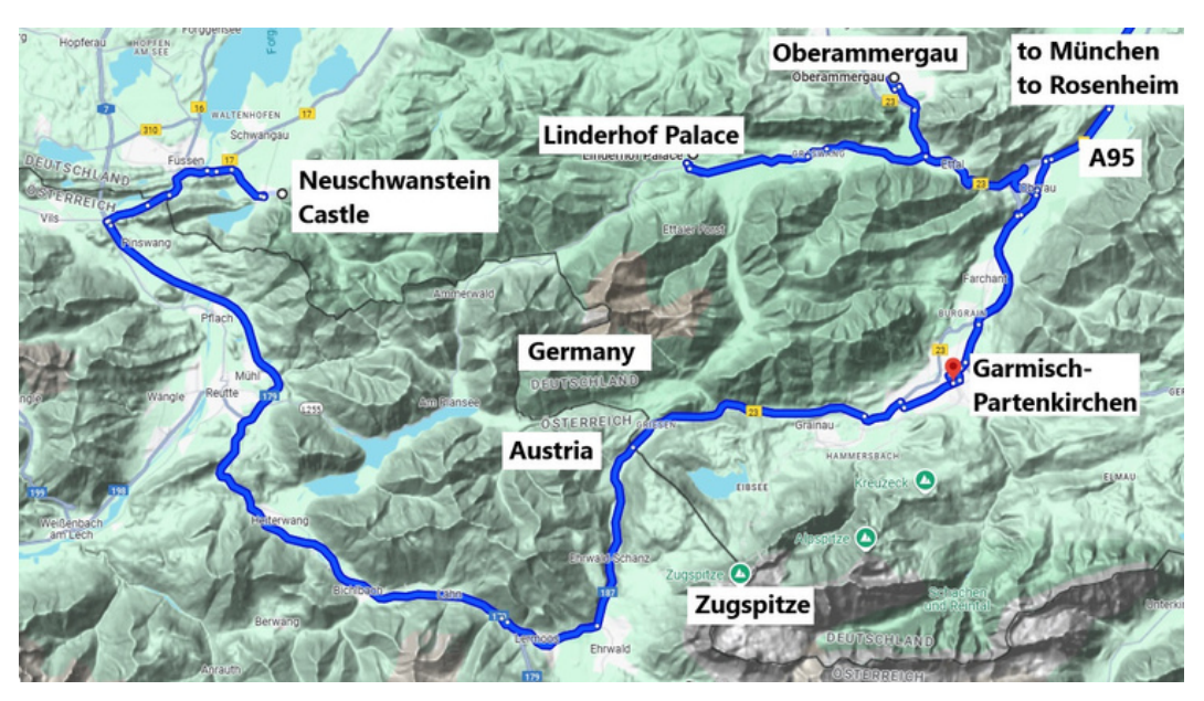
Our paths in Bavaria (1993)