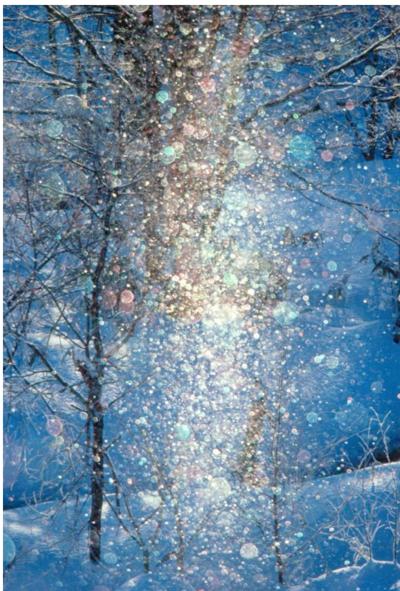
Sun Pillar

I know some other places near Asahikawa; Biei and Furano, and even Takasu are good places to see this wonderful show of nature, if the conditions are right. After these coldest days have passed, the wind begins to blow easterly, and you might even feel sad about the passing of winter.