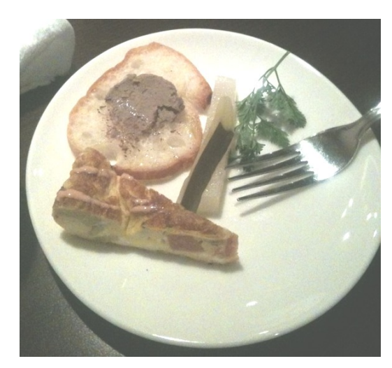
Ham and Potato Frittata, Pickled Vegetables, and Pate on Toast.