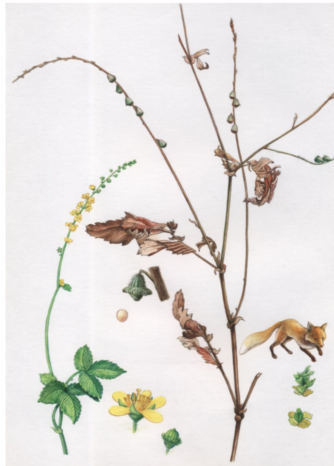
Water Color Painting of a Kin-Mizuhiki By Hitoshi KUDOH

Distribution: Hokkaido, Honshu, Shikoku, Kyushu. Korea, China, Russia