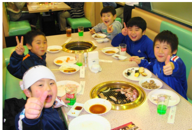
The jovial family atmosphere at Five Star.