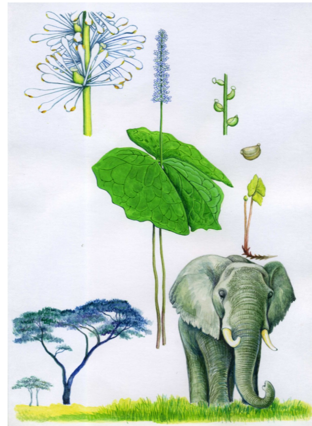
Water-colour painting of Nambuso By Hitoshi KUDOH

“Yes, I know...Though Achlys is a clump-forming plant, here stands only a solitary one. That means this plant is also on the verge of...” sighed I.