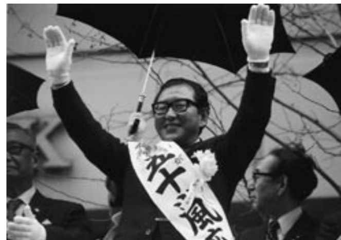
IGARASHI Kozo, mayor of Asahikawa from 1963 to 1974.