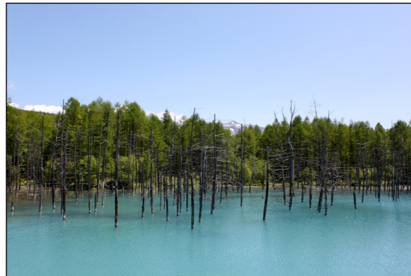
Aoi-ike, this year (June)

About 10 years ago, this place was not widely known and was rarely visited. But now, there are many tourists coming to see Aoi-ike and it doesn't seem to be a rarely visited region any more. Frankly speaking, I have mixed feelings about this. However, I'm happy people can view beautiful scenery such as this. It's recommended that you go to Aoi-ike on a clear day.