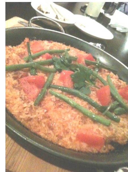
Tomato and String Pea Paella