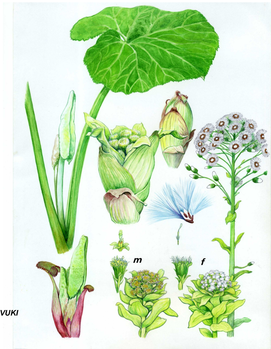
A Watercolor Painting of AKITAVUKI By Hitoshi KUDOH

Female flower-heads are white, and have many thread-like styles. They grow to 1.5 meter or more till they bear fruit clusters. The fruit is a typical clock.