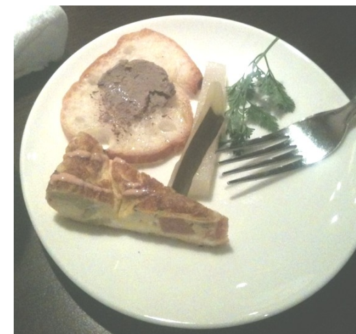
Ham and Potato Frittata, Pickled Vegetables, and Pate on Toast.