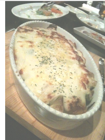
Avocado, Bread, and Mozzarella Cheese Gratin

Address: Asahikawa City 2-jo 8-chome (Kaimono Koen Shopping Street) Operating Hours: 11:00am ~ 11:00pm (12:00am on a night before a Public Holiday) Contact: 23-5977 machibar@momendoki.co.jp