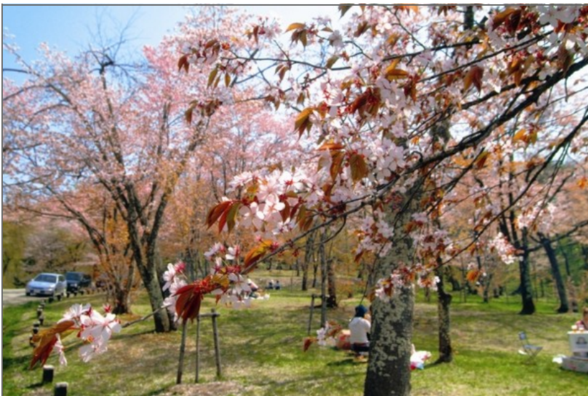
Ohanami in Asahiyama Park

The famous cherry blossoms viewing spot in Asahikawa is Asahiyama-park (旭山公園.) Asahiyama-park is located close to the Asahiyama Zoo. This year, it is expected that cherry blossom will begin to fully bloom in the middle of May. To hold a Ohanami party all you need is a plastic sheet and the good fortune that it’ll be a fine and clear day.