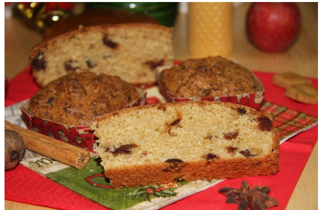
Mini Cup Christmas