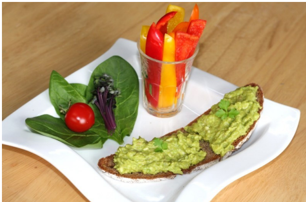
Spicy Avocado Pe-