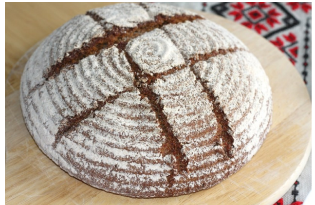
Homemade Brown Bread