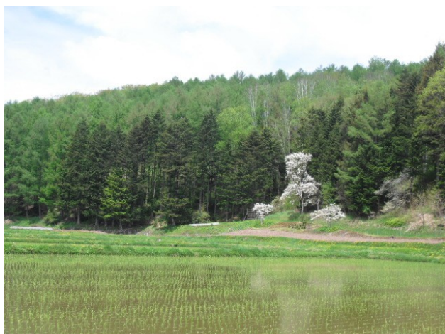
The view outside Yokoyama's farm cottage