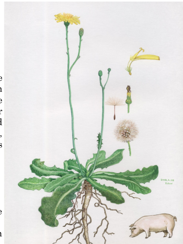
Water Color Painting of a Butana By Hitoshi KUDOH

Distribution: Hokkaido, Honshu, Shikoku, Kyushu. Native to Europe.