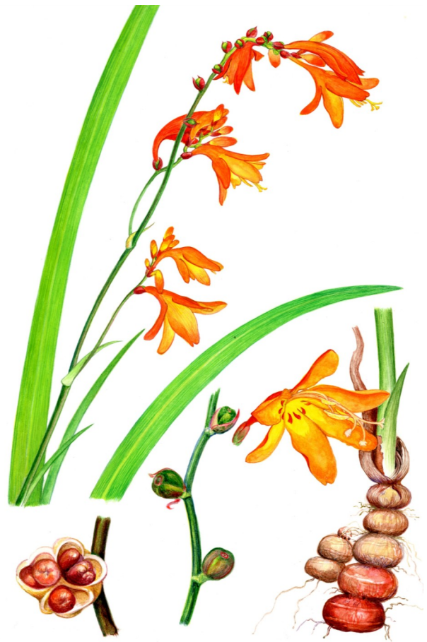
Watercolour painting of Montbretia By Hitoshi KUDOH

Distribution: Widely naturalized all over the world.