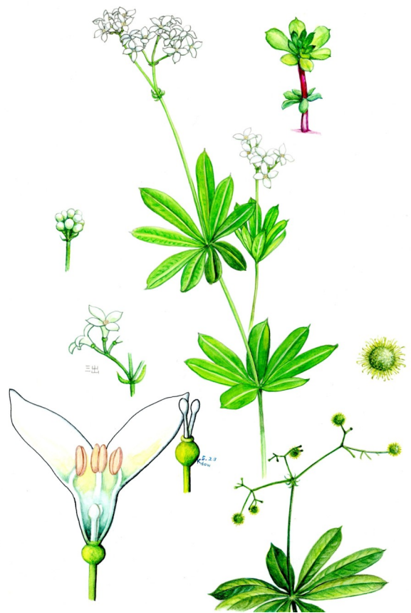
Water color painting of a Sweet Woodruff By Hitoshi KUDOH

Distribution: Asia, Europe, North Africa.