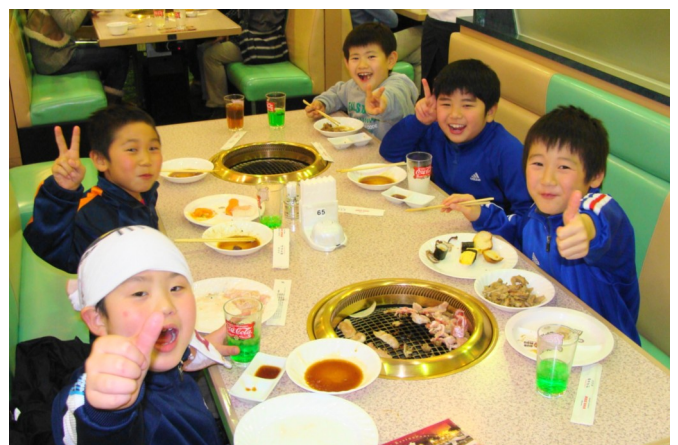
The jovial family atmosphere at Five Star.