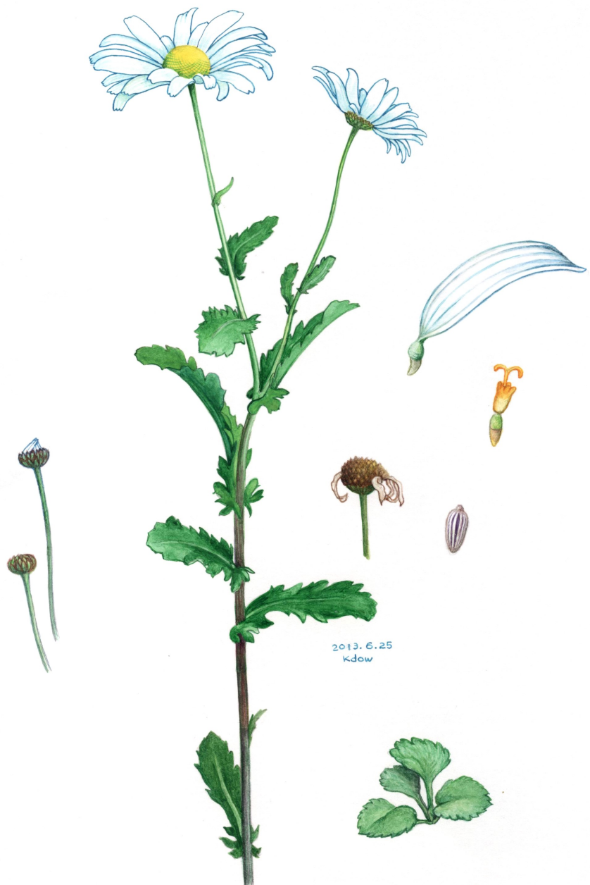
Water Colour Painting of a France-Giku By Hitoshi KUDOH

Description: A perennial herb 70 cm high. Its ovate-leaved shoot sprouts from a rhizome or a seed. Mostly the stem is not branched and erect. Alternate leaves are serrated, dark green. White ray florets surround a yellow disc. Seeds have no pappus.