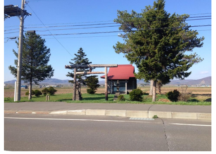
One of Lawson's favorite spots in Takasu Town