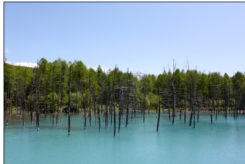
Aoi-ike, this year (June)

About 10 years ago, this place was not widely known and was rarely visited. But now, there are many tourists coming to see Aoi-ike and it doesn't seem to be a rarely visited region any more. Frankly speaking, I have mixed feelings about this. However, I'm happy people can view beautiful scenery such as this. It's recommended that you go to Aoi-ike on a clear day.