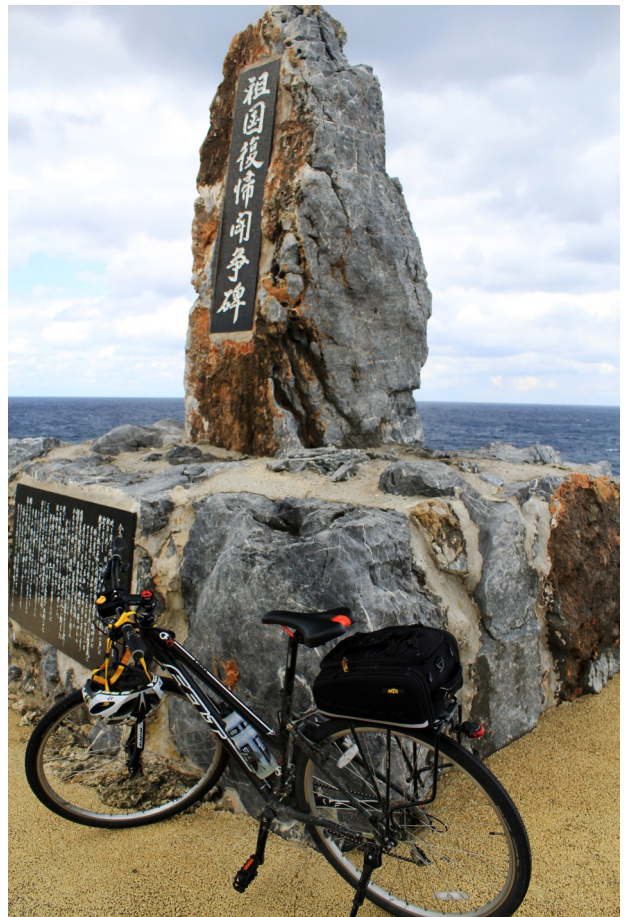
Stacey's photograph from cycling around Okinawa