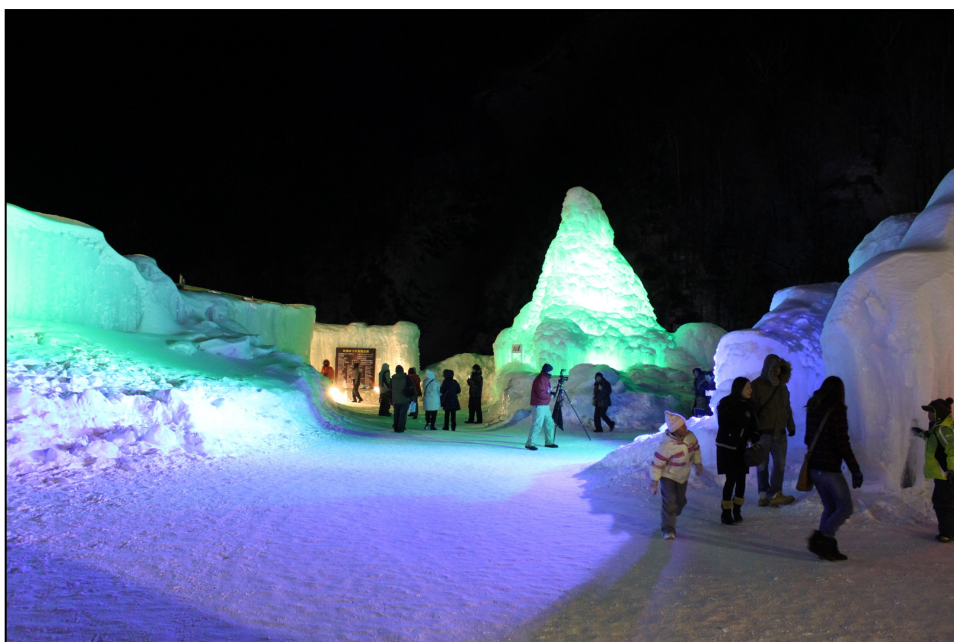
One of the Ice Towers at the Sounkyo Ice Festival (2012)

As you might suspect, it will be very cold if you go to this event in the night. When I went there, temperatures exceeded -15^{\circ}\text{C} . It is important to wear gloves, a warm cap, and perhaps skiwear. Otherwise, you won't be able to enjoy these beautiful sights freely. As a matter of fact, I didn't wear my gloves because I couldn't use the camera precisely them on, but I gave up in less than thirty minutes. When you go to this event, I highly recommend that you take appropriate measures and sufficiently prepare against cold.