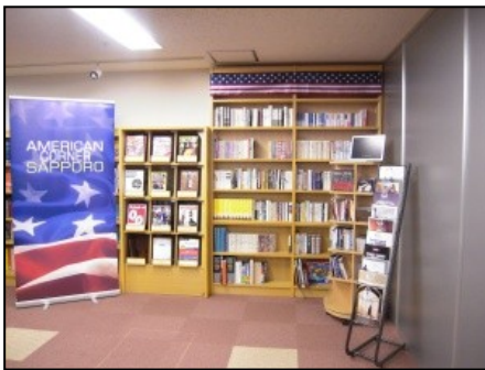
American Corner at the Sapporo International Plaza