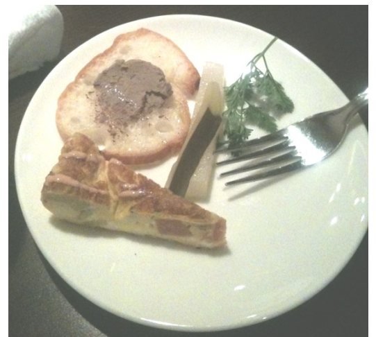
Ham and Potato Frittata, Pickled Vegetables, and Pate on Toast.