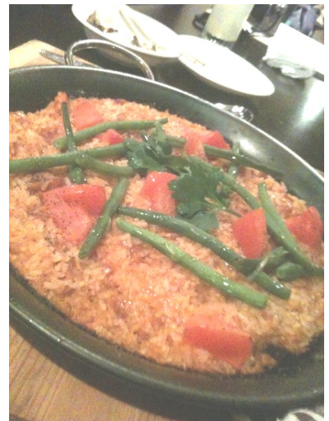
Tomato and String Pea Paella

Address: Asahikawa City 2-jo 8-chome (Kaimono Koen Shopping Street) Operating Hours: 11:00am ~ 11:00pm (12:00am on a night before a Public Holiday) Contact: 23-5977 machibar@momendoki.co.jp