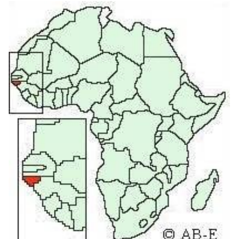
Republic of Guinea