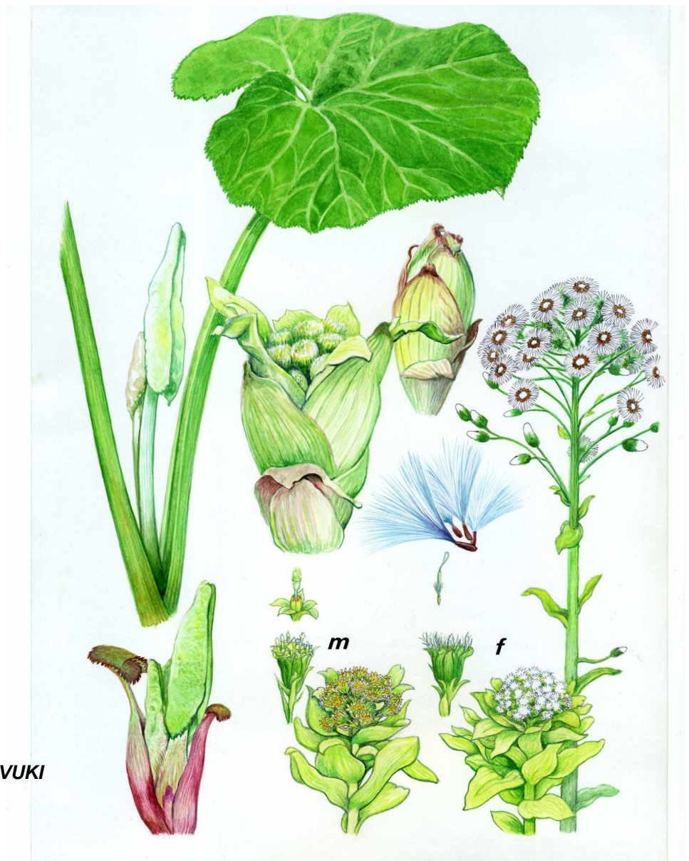
A Watercolor Painting of AKITAVUKI By Hitoshi KUDOH

Female flower-heads are white, and have many thread-like styles. They grow to 1.5 meter or more till they bear fruit clusters. The fruit is a typical clock.