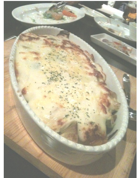
Avocado, Bread, and Mozzarella Cheese Gratin

If you've walked down Kaimono Koen Shopping Street lately you've bound to have noticed the Mediterranean style eatery Machi Bar. From the outside its open front makes it quite enticing to the curious passerby.