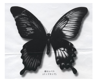
Ascalaphus Swallowtail ( Papilio ascalaphus ) South Sulawesi (Indonesia)