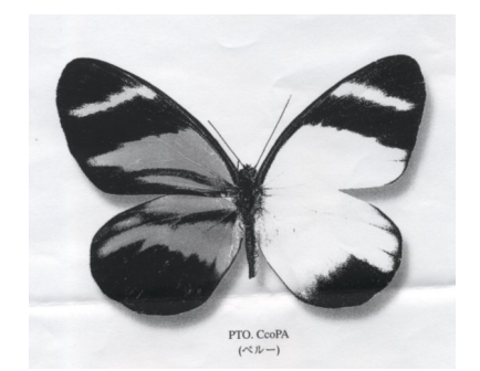
Pamela ( Perrhybris pamela ) Peru