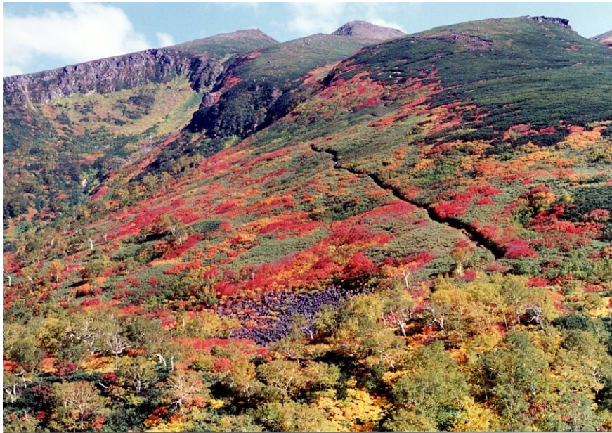
Arashiyama in September

SHIMA-TSUTSUJI, Arctous alpinus , and CHINGURUMA, Geum pentapetalm , which all contrast the green of creeping pines. Later in the month, surrounding hills of KOGEN-ONSEN and GIN-SENDAI, as well as the highlands beyond SOUNKYO spa become a paradise of colors, as the various rowan family plants, such as Sorbus sambucifolia and S.matsumurana ,