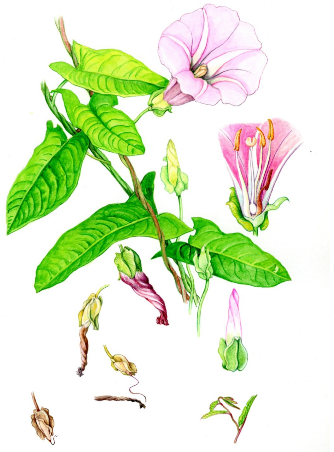
Water colour painting of a Hirugao By Hitoshi KUDOH

Distribution: Hokkaido, Honshu, Shikoku, Kyushu; Eastern China, Korea.