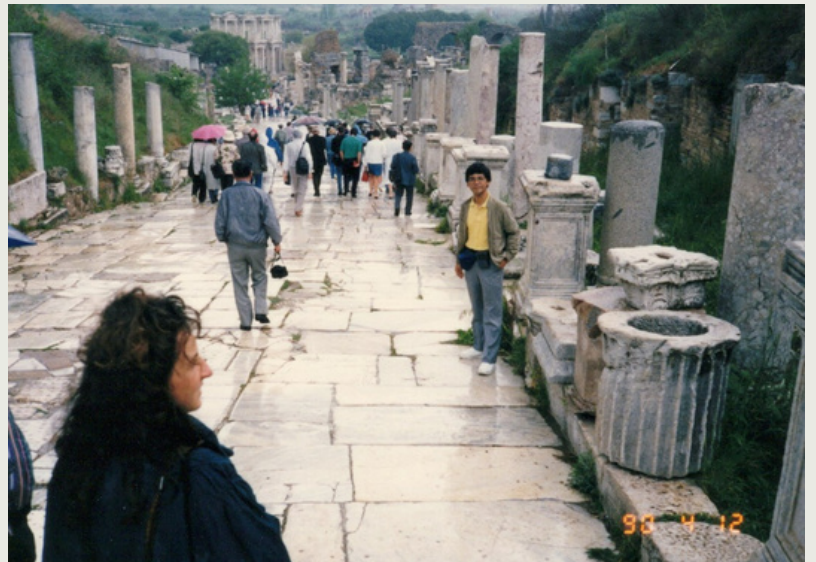
On the ancient streets, Ephesus, Turkey (1990)