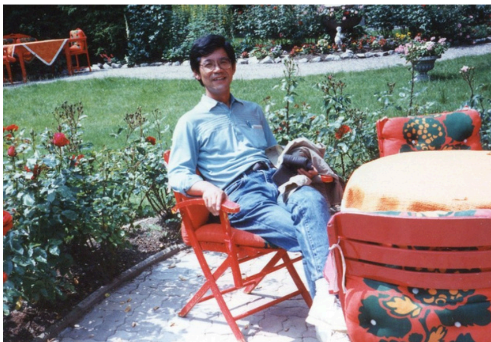
At Pension Börgener, Osterode am Harz, Germany (1990)