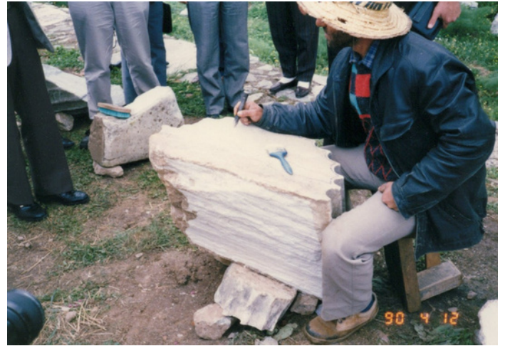
Repairing excavated parts in Ephesus, Turkey (1990)