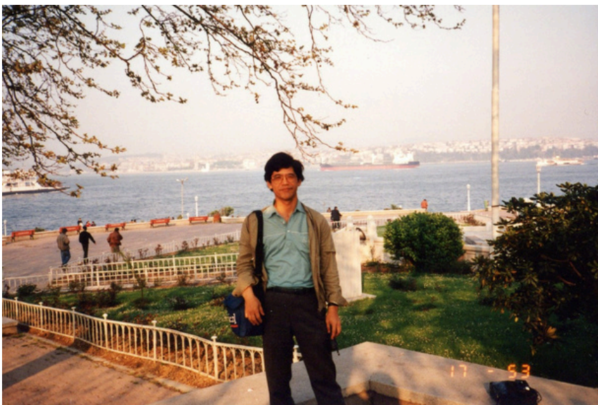
Bosphorus Strait, Istanbul, Turkey (1990)