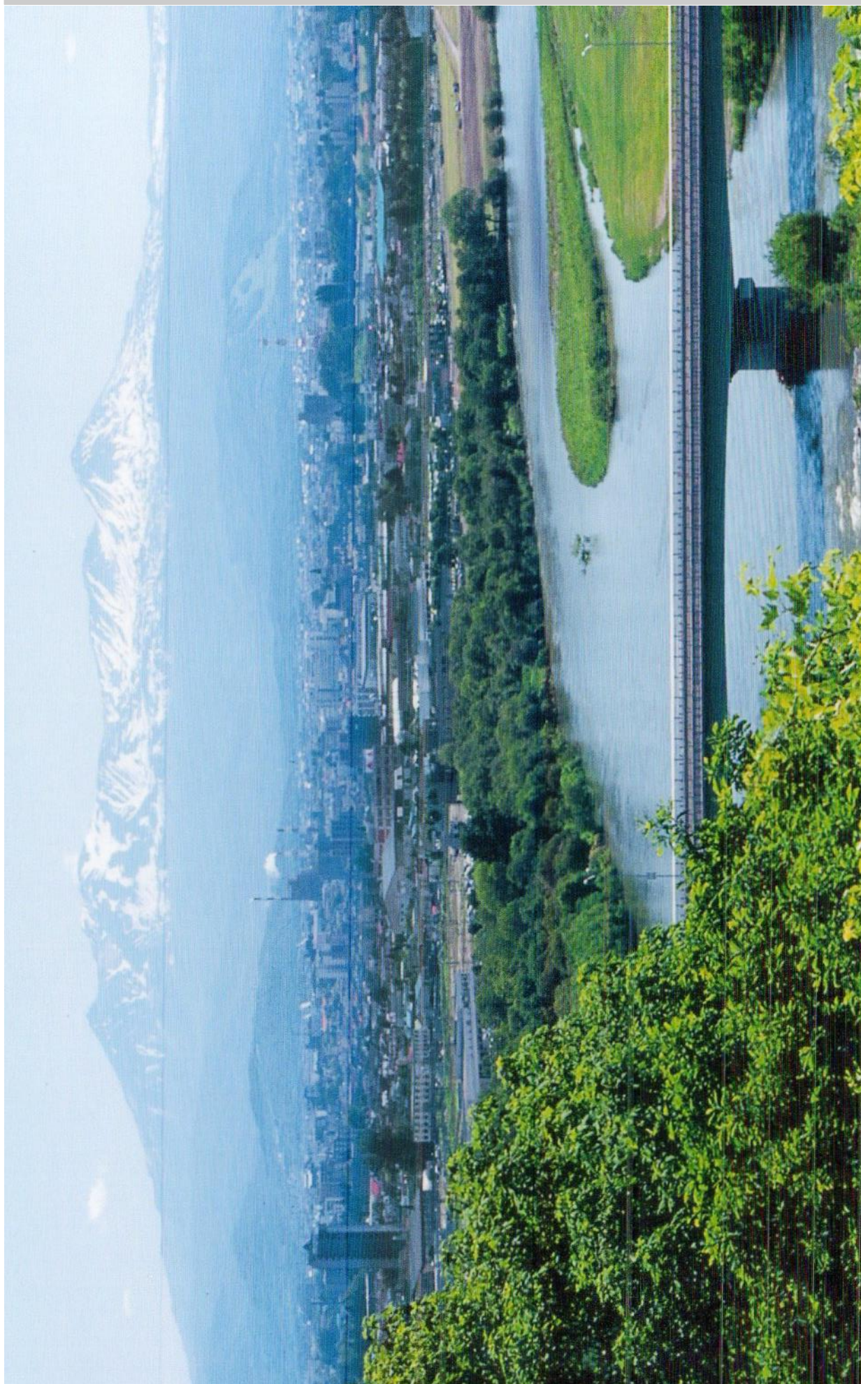
Photo: A view from Hoppono Yaso En Check out the color version at http://asahikawaic.jp/publication/up/docs/asahikawa_info_may2017