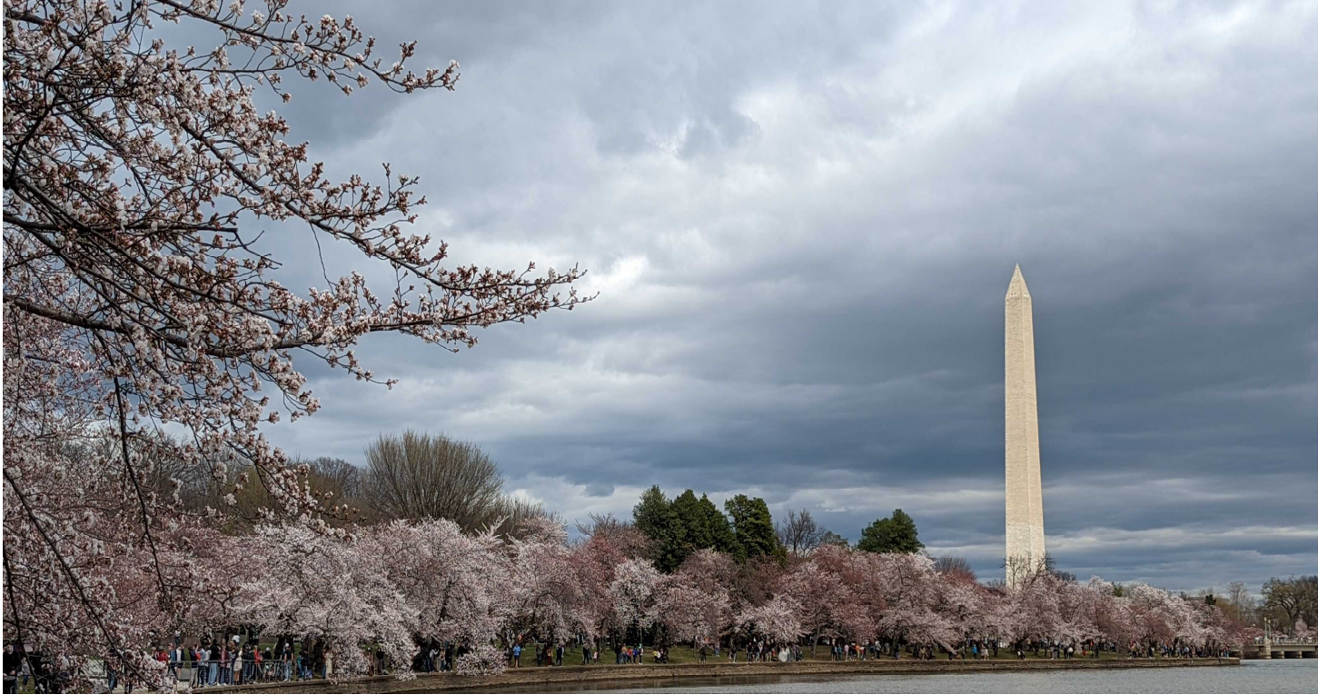
National Mall Tidal Basin in Washington D.C. during peak bloom of Cherry Blossoms (April 2022)

One of the spotlights of America would be, in my opinion, the DC-Maryland-Virginia area (DMV for short). The main parts of the DMV area is composed of the District of Columbia at the center and parts of southern Maryland and northern Virginia which are all connected by the DC Metropolitan Metro System which are a series of metro rail networks that connects the residents of this fine area.