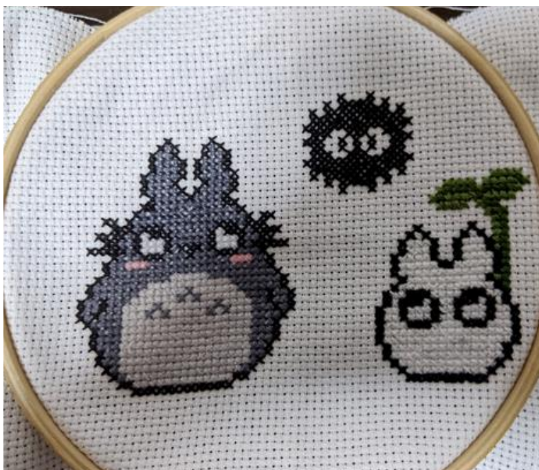
My first cross-stitch

Z. A.: I enjoy exploring new places, cooking, skiing, and reading. Since the coronavirus started, I've also started a couple of new hobbies that I can do at home. I've enjoyed learning to cross-stitch and to bake!