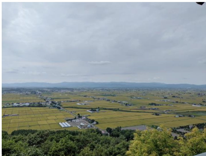
View from Kitoushi Tenboukaku

Z. A.: I like the combination of the warmth and community of a small town with the convenience of a city only 20 minutes away. Higashikawa is very lively, with lots of events, and is very open to new people and new ideas. There are many of spots with beautiful views; in particular, I like the view from Kitoushi tenboukaku, which offers a bird's-eye view of the whole town. There are also lots of fantastic cafés and restaurants that I enjoy going to.