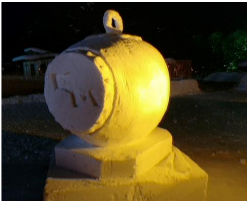
Higashikawa ice festival sculpture made by a Canadian Taiko group that visited Higashikawa which symbolizes the friendship between Japan and Canada

Z. A.: I think the biggest differences are multiculturalism and style of communication. Canada is a country quite literally built by immigrants, and the mix of these diverse cultures is visible every single day and almost everywhere you go, while Japan is much more homogenous both ethnically and culturally. The style of communication in Canada is as a whole much more direct than in Japan.