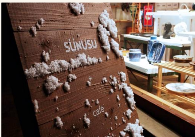
Sunusu Café sign in the snow