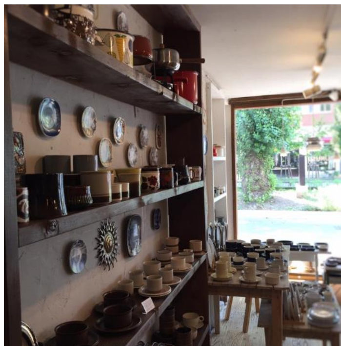
Finnish and Danish vintage ceramics and porcelain are sold below