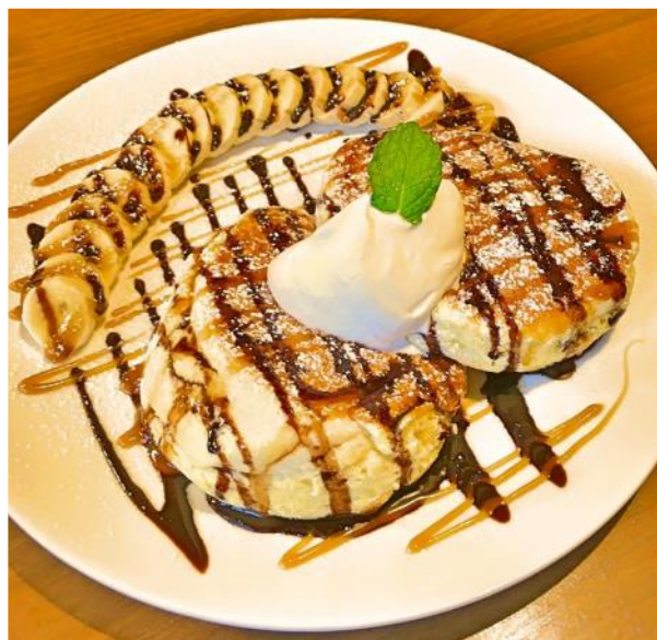
Banana Chocolate Caramel Pancake