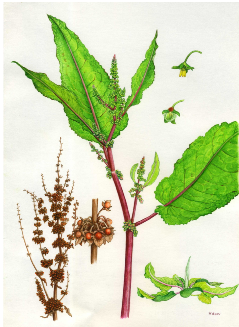
Watercolour painting of EZONO - GISHIGISHI By Hitoshi KUDOH