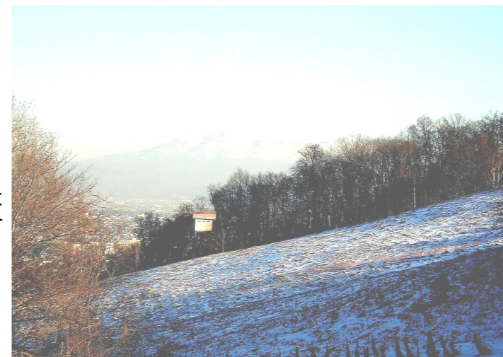
Mt. Taisetsu Range from Arashiyama, November

As for Asahikawa, we are entering the pleasant winter season and looking forward to snow sports.