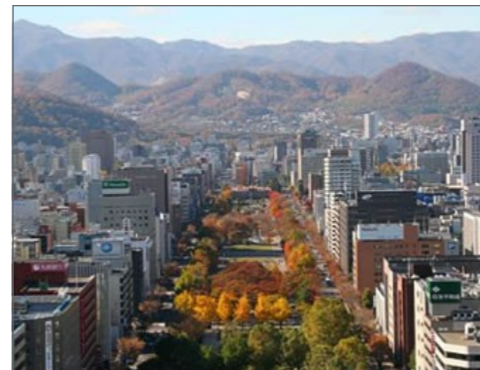
View of Sapporo in autumn

And if it's that cold that you cannot go to Momiji-gari , you can hold a Kanpuu-kai !