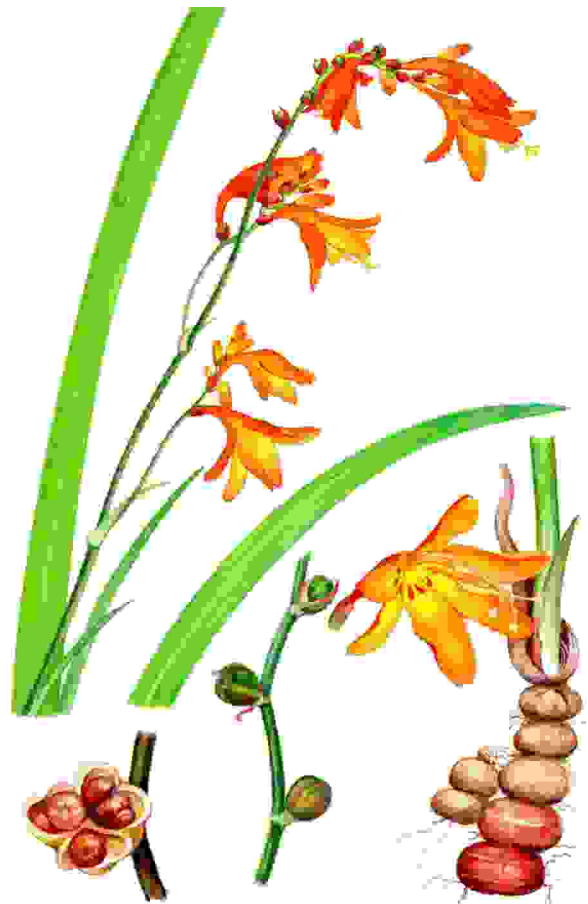
Watercolour painting of Montbretia By Hitoshi KUDOH

Distribution: Widely naturalized all over the world.