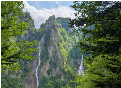
Observatory for Ryusei and Ginga Waterfalls

About a 4 minute drive or a 42 minute walk away from the Sounkyo bus stop are Ginga Waterfall (銀河の滝) and Ryusei Waterfall (流星の滝) rest area. There visitors of the Sounkyo area can park their vehicles and enjoy the majesty of the two waterfalls and Ishikari River. The rest area has restrooms, a gift shop, as well as a small stand to by snacks and ice cream. Visitors can enjoy the waterfalls up close, or get a complete view of the two waterfalls by climbing a short inclined hike to its nearby observatory. These waterfalls are especially beautiful during the summer with its abundance of greenery and the fall as the foliage create a stunning view with its autumn colors.