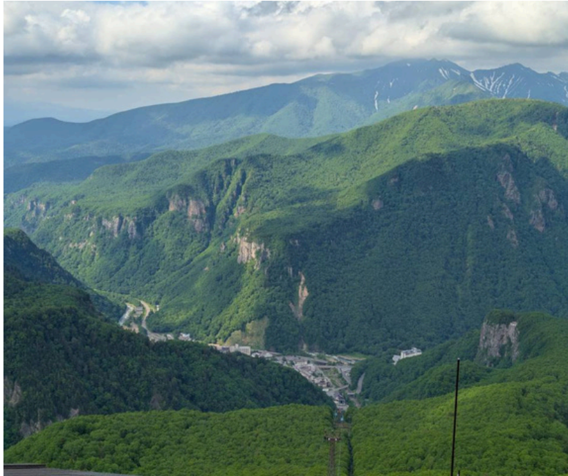
View from Kurodake Ropeway Station

The Hokkaido prefecture is rich of beautiful sights and nature is admired nationwide and abroad. 1~1.5 hours away from Asahikawa are a range of gorges called Sounkyo (層雲峡). This area is known for being the access point for Kurodake (黒岳), one of the big mountains of Taisetsuzan as well as its many astonishing views and adventurous hikes with rivers and waterfalls, but also for their magnificent hotels and relaxing hot springs.