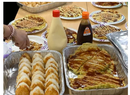
Potluck with international students

A potluck is a communal gathering where friends, family, or members of the community gather for a meal where instead of the hosts, the guests bring food to share with everyone. The closest equivalent to a potluck would be a mochikomi party (持ち込みパーティー) here in Japan. During the potluck attendees typically bring their homemade cooking to share with everyone. Many local Americans as well as immigrant communities gather and bring their own unique dishes to enjoy with everyone. Of course, potlucks do not typically require people to bring home cooked meals as some people occasionally bring snacks, drinks, and food bought from restaurants to contribute. During a potluck, it is an opportunity for attendees to showcase their cooking as well as to taste the recipes of friends, family, and the community. Not only is it an opportunity to enjoy a variety of cuisine and flavors, but also an opportunity to connect with others through food!